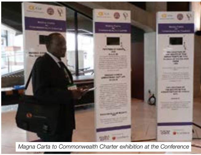
Magna Carta to Commonwealth Charter exhibition at the Conference