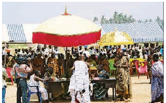
Mock trial in traditional court – Cape Coast Ghana - 2005