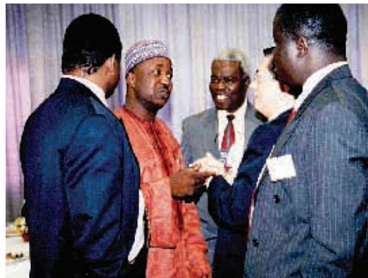
Council members in discussion during the study visit to Singapore, 1999