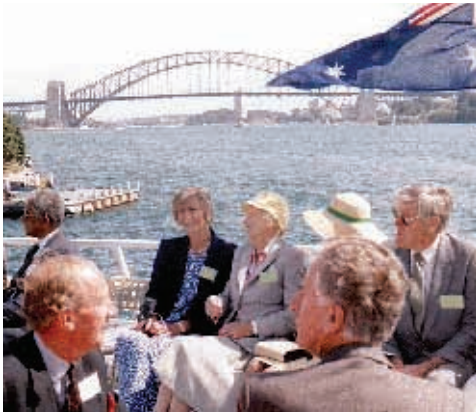
Delegates during a day trip in Sydney 1991