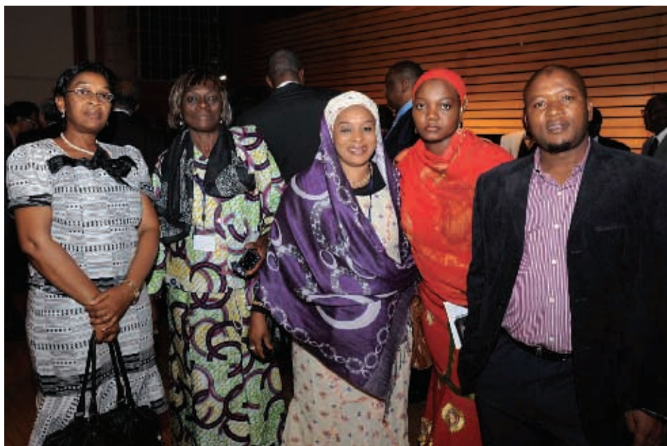
Delegates at the CMJA 40th Anniversary Dinner, September 2010

The SOLM met from 18-20 September 2010 to discuss the agenda for the