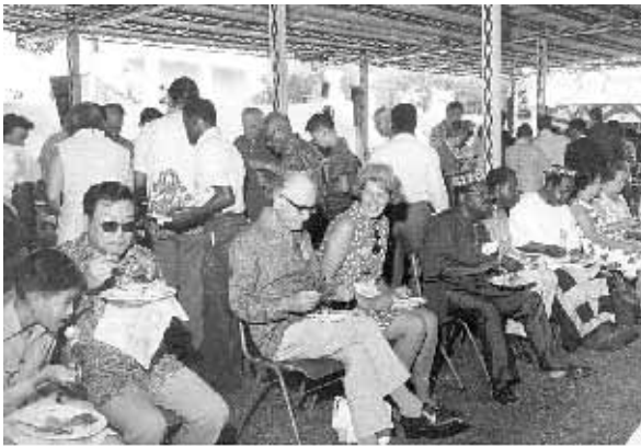
Delegates during a day out to Malacca, Malaysia 1975