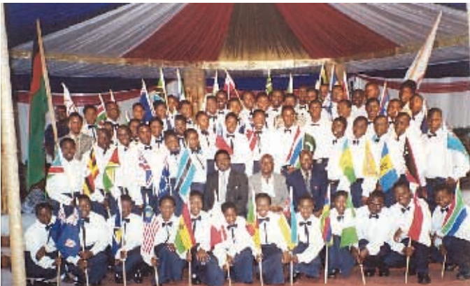
The flagbearers and officers of the Local Organising Committee – CMJA Triennial Conference, Mangochi, Malawi 2003