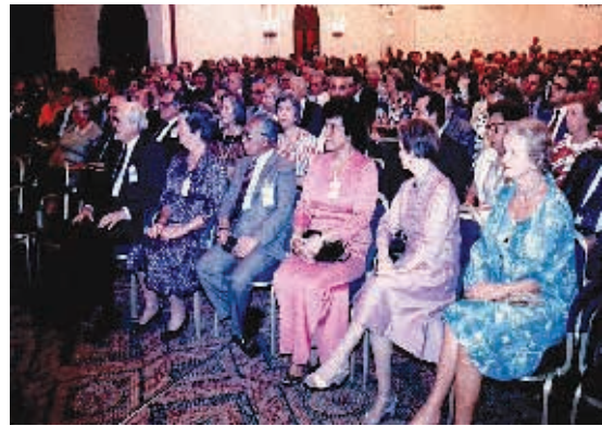
Delegates at the Opening of the Seventh CMA Conference, Cyprus 1985