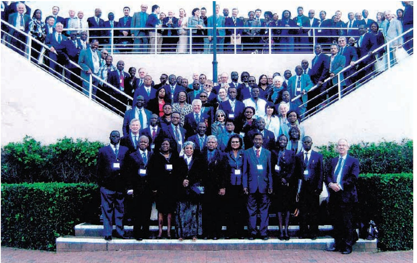
Brighton 2010 CMJA Conference Delegates "Community Justice and Judicial Independence: Local Issues, Commonwealth Standards"